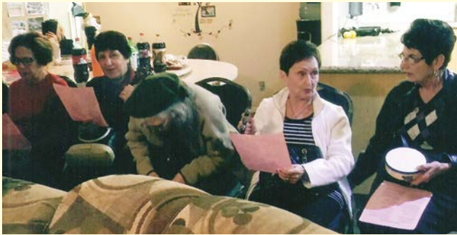
Dorcas Guild at Valley Teen Ranch.